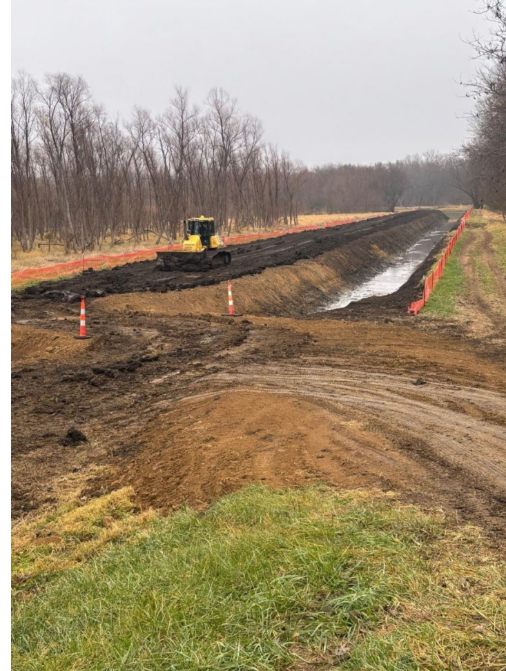
Photo: 11/24/2025, levee earthwork to install new force main