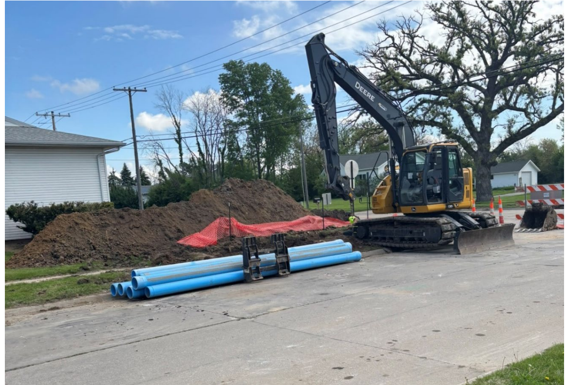
Photo: 5/13/2025, water main installation on Clymer Rd. in Hiawatha