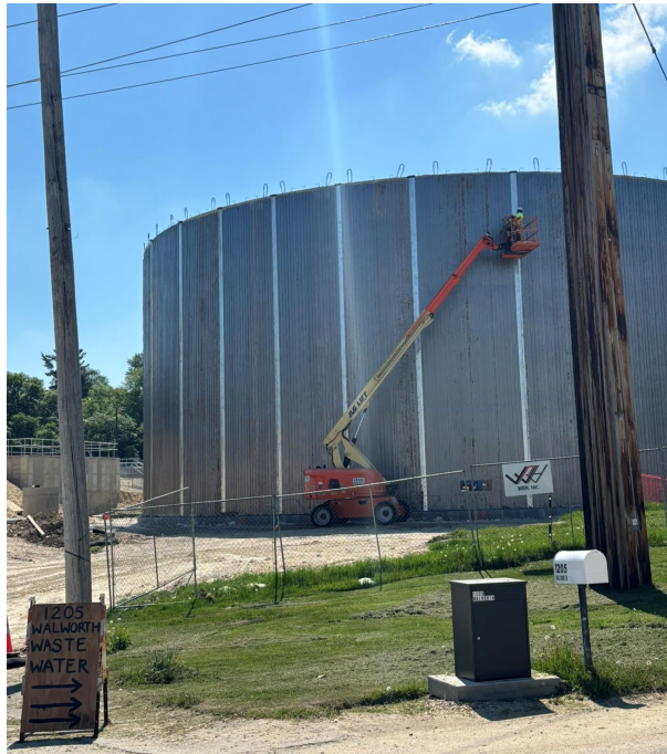
Photo: 5/14/2025, equalization basin under construction