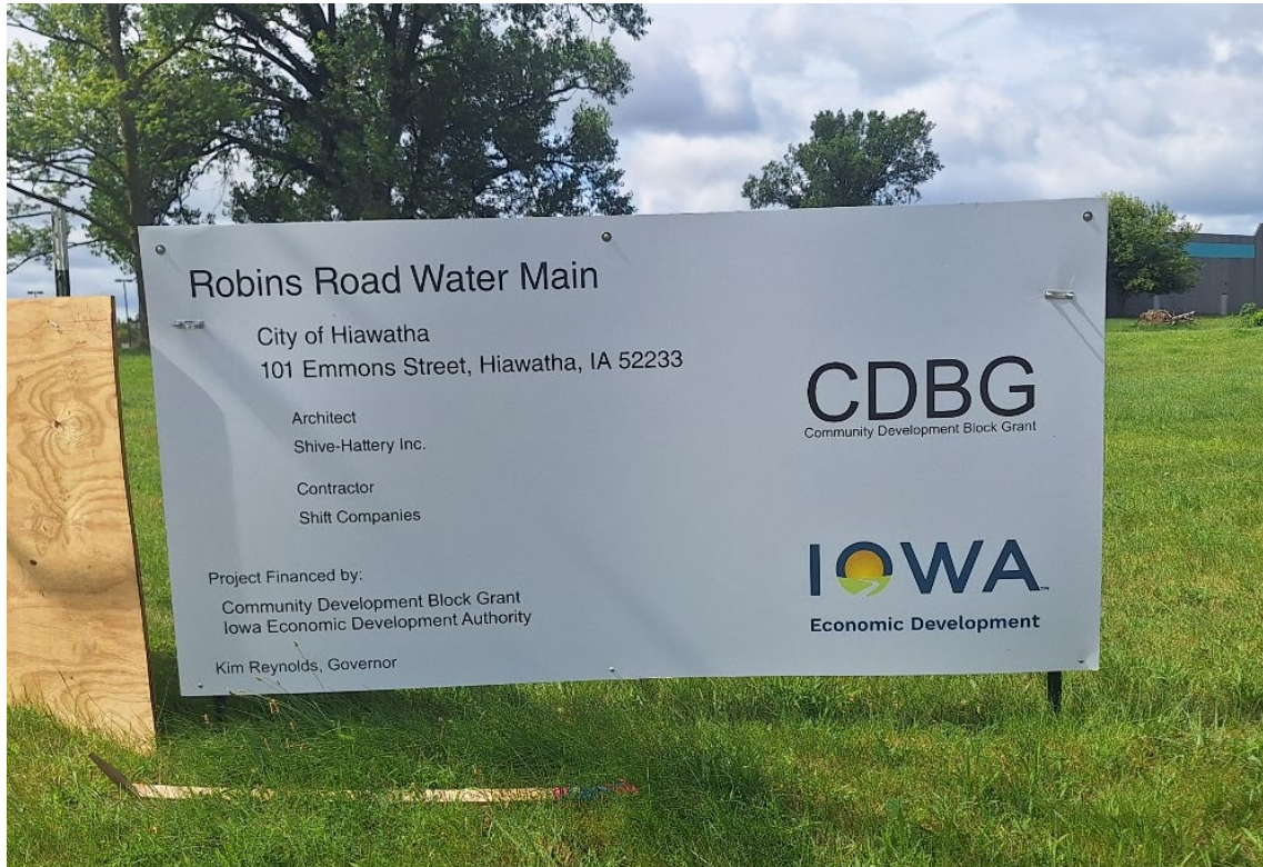
Photo: 8/9/2024, CDBG sign on Robins Rd. in Hiawatha